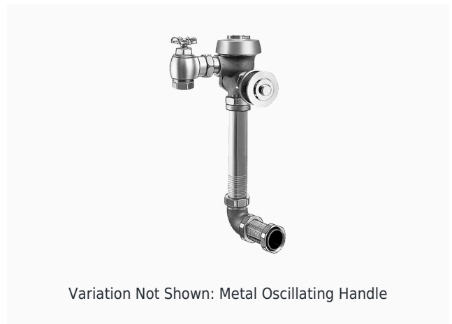
Variation Not Shown: Metal Oscillating Handle