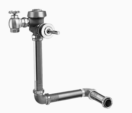
Variation Not Shown: Ground Joint

ROYAL® MANUAL FLUSHOMETER ROYAL 143-1.6-14-3/4-LDIM