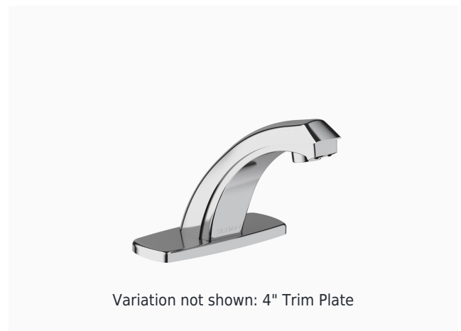
Variation not shown: 4" Trim Plate