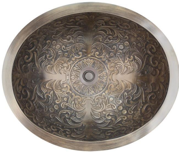
Shown in AB

Linkasink warranties our product to be free from manufacturing defect for the life of the product. Warranty does not cover improper care, neglect or abuse or normal wear-and-tear