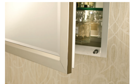
Side Mirror Kit SMK4-30 Order for Surface Mount